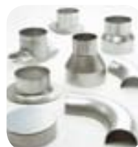
Air Duct Parts