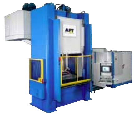
ODEN-F Long stroke press Forces up to 12,500 kN Bed up to 2,500 x 1,900 mm Mono-block frame