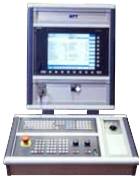
HNC Servo/NC control system that uses the latest in hydraulic motion technique. The system is adapted for hydroforming applications and operates with high accuracy in positioning, speed control and pressure regulation.