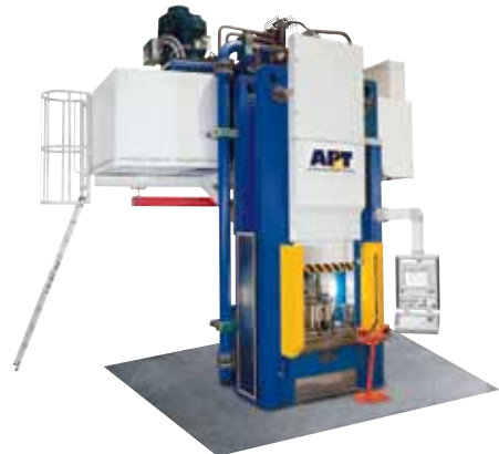
HMD A hydroforming press with an oil supported diaphragm. Forming pressure 35/70/100 MPa Blank diameter \varnothing 380/635/810 mm Press frame force 9,200 - 40,000 kN