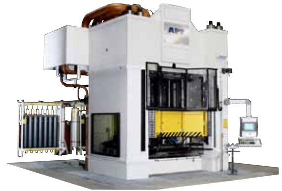
ODEN-FT Long stroke press Forces up to 25,000 kN Bed up to 3,600 x 2,800 mm Tie rod design