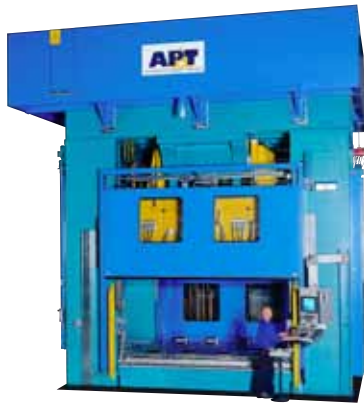
HF Short stroke press Forces up to 100,000 kN Bed up to 3,600 x 2,700 mm Tie rod design Prism guiding of slide