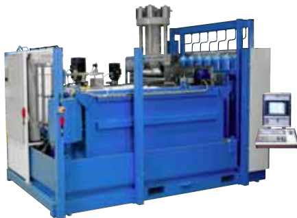
HPS Retrofit Water and hydraulic high pressure system with HNC control for retrofit. Includes functions like quick-fill pump, pre-form pump, pressure intensifier, tool axes and on/off valves.